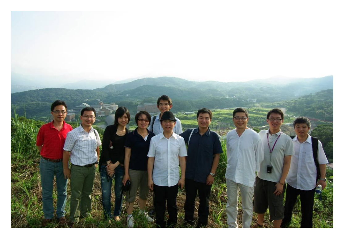
Visiting Taiwan, group photo at Dharma Drum Mountain