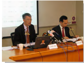
Public Attitudes towards the Harmonious Society in Hong Kong (6 March 2012)