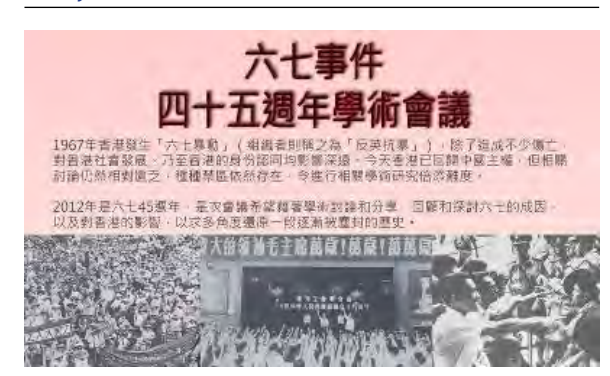
"Academic Conference on the 1967 Incident"

This conference was held on 26 May 2012 in Cho Yiu Conference Hall at the Chinese University. Thirteen guest speakers shared their viewpoints on this topic,