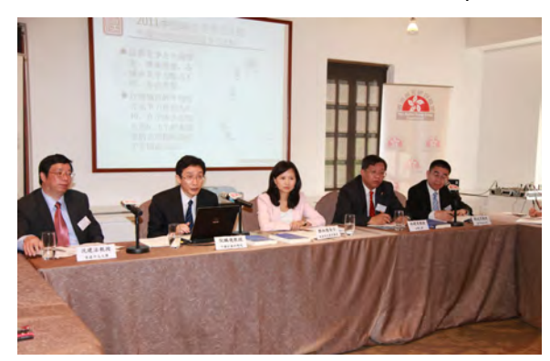
Press conference of 2012 China urban competitiveness report (Hong Kong)

The Programme, under the name of the Institute, co-organized the annual event "Press 2012 conference of China urban competitiveness report (Hong Kong)"《中國 城市競爭力報告2012》香港發佈會with The Better Hong Kong Foundation and Centre for City and Competitiveness, Chinese Academy of Social Sciences on 23 May 2012. Hong Kong was ranked first for seven consecutive years.